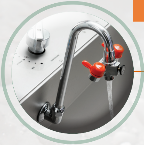
Optional laminar flow head with optional eye wash.