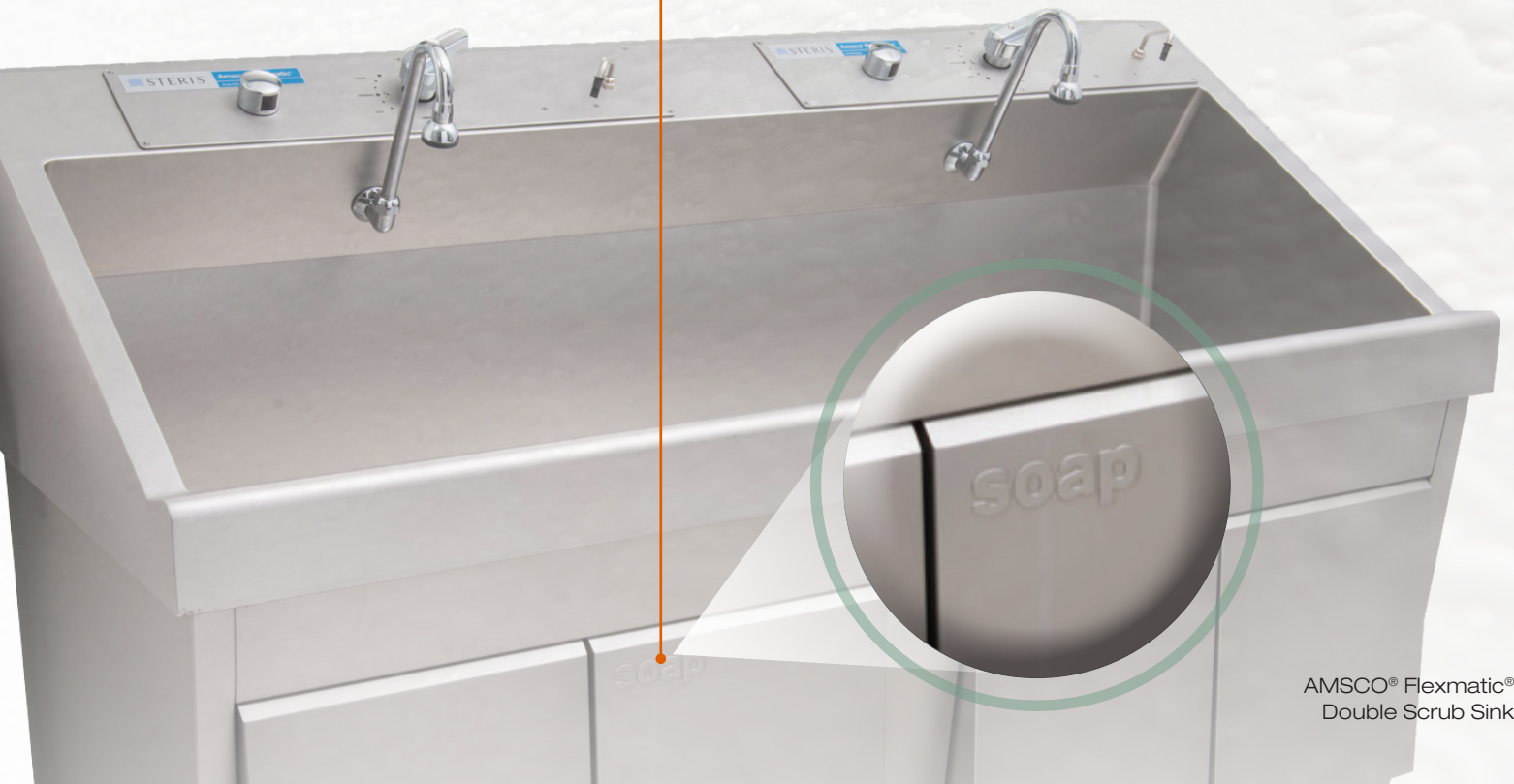
AMSCO® Flexmatic® Double Scrub Sink

Efficient hand washing starts with hands free water and soap control. Knee-activated panel turns the water on and off and dispenses the right amount of soap every time.