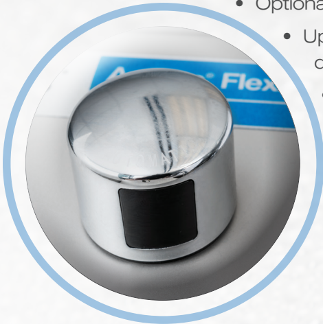
Optional infrared sensor