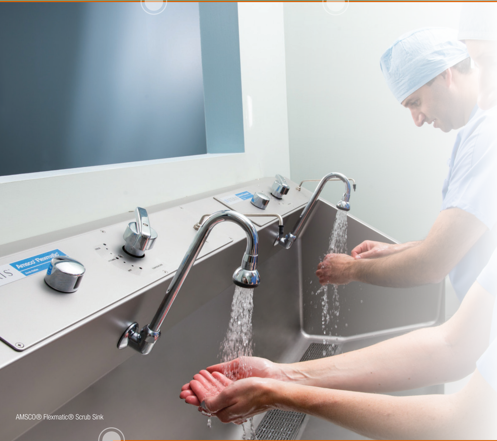
AMSCO® Flexmatic® Scrub Sink