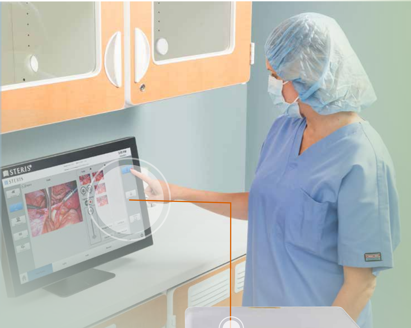
Harmony iQ ® 2800 OR Integration System